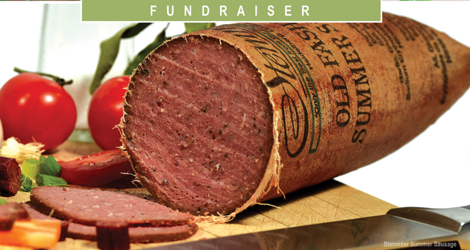
Stemmler Summer Sausage

3031 Lobsinger Line Heidelberg Ontario, N0B 2M1 Tel: (519) 699-4590